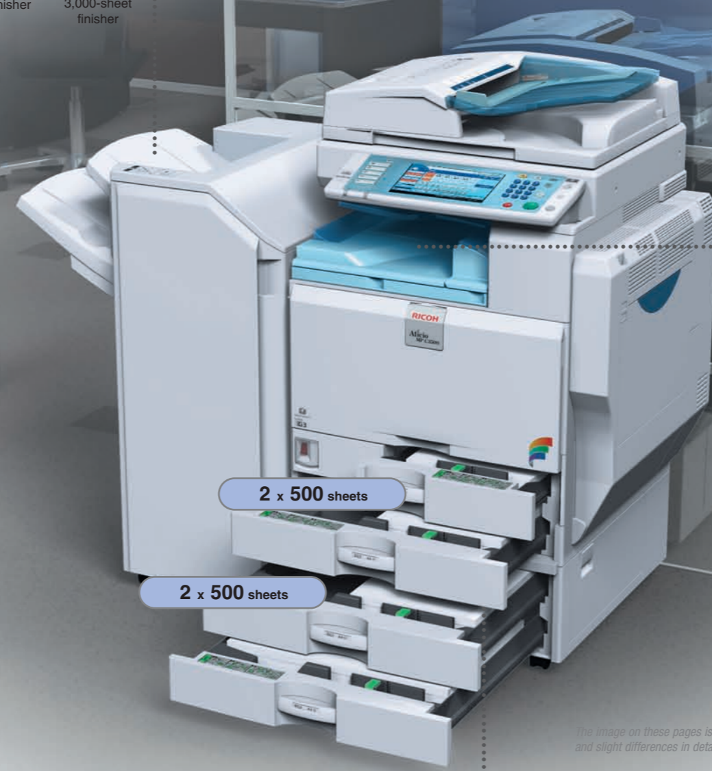
The image on these pages is not a real photograph and slight differences in detail might appear.