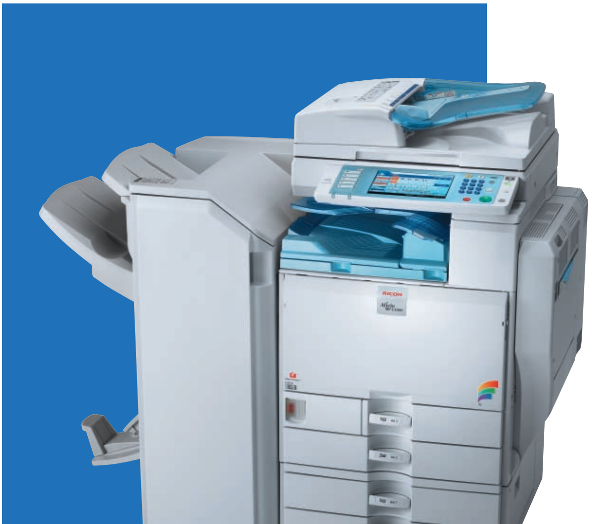
Aficio™ MP C3500/MP C4500